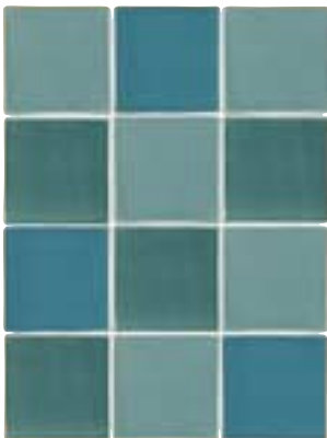
Aqua Mist, Emerald, Adriatic