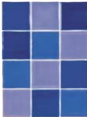
Lavender, Hyacinth, Bluebell, Columbine