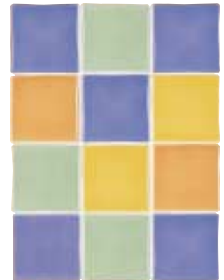
Lavender, Crabapple, Fuchsia, Barley