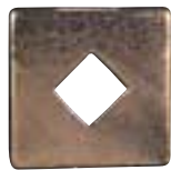
NB5932 Gold Caboche Cut