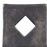
NM5932 Graphite Caboche Cut