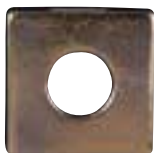
NB5931 Gold Brilliant Cut