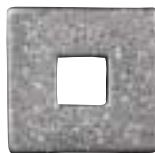
NM5930 Graphite Square Cut