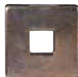
NB5930 Gold Square Cut