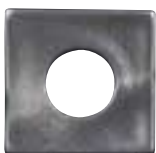
NM5931 Graphite Brilliant Cut